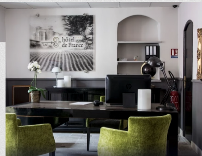
HOTEL DE FRANCE