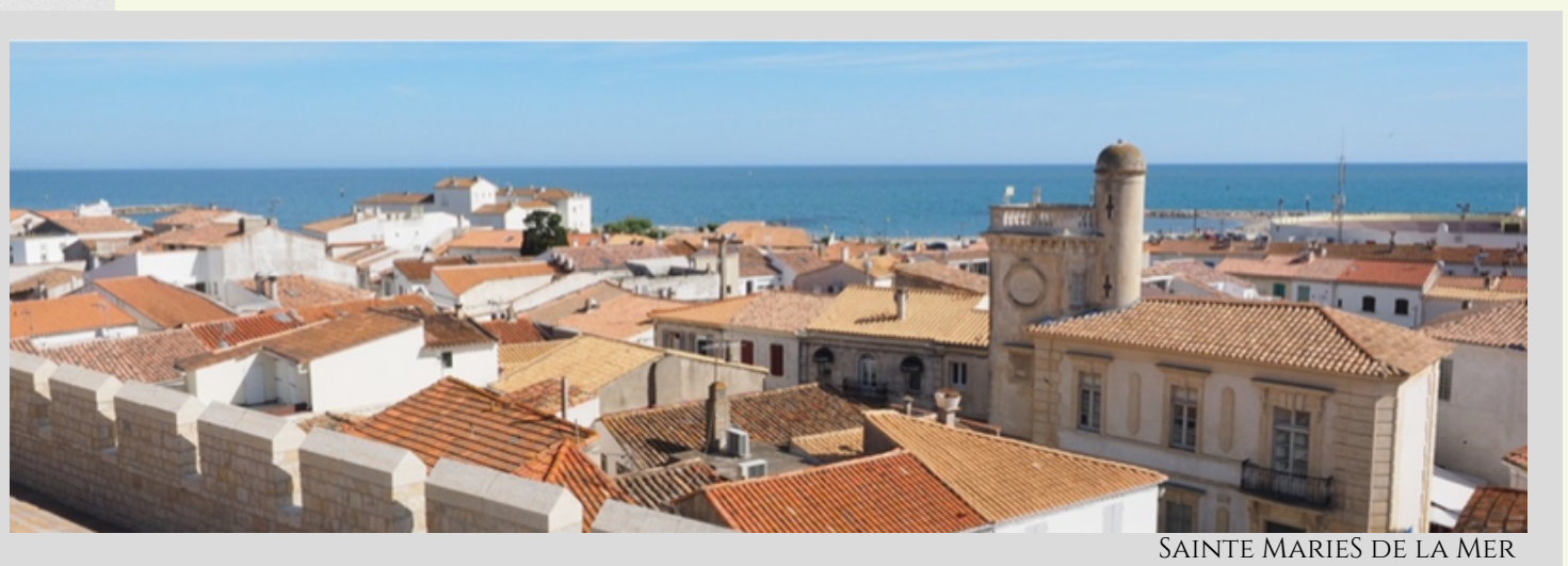
MAS DEL FOUQUE