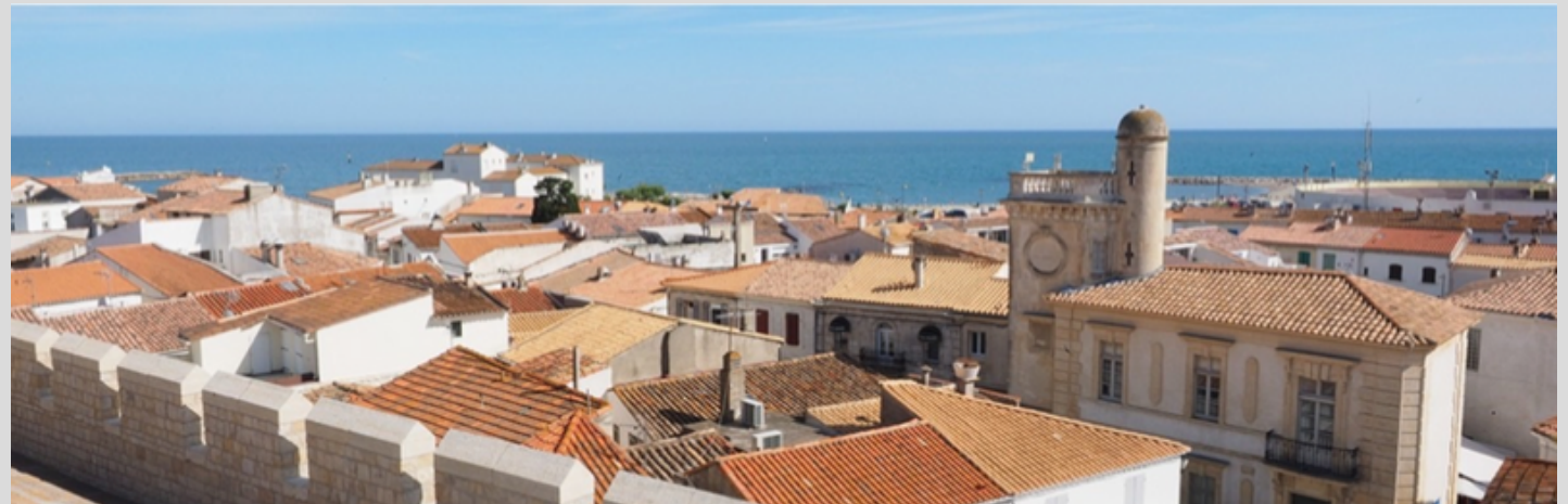
SAINTE MARIES DE LA MER