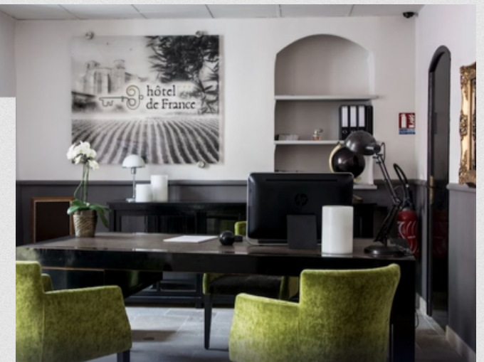
HOTEL DE FRANCE