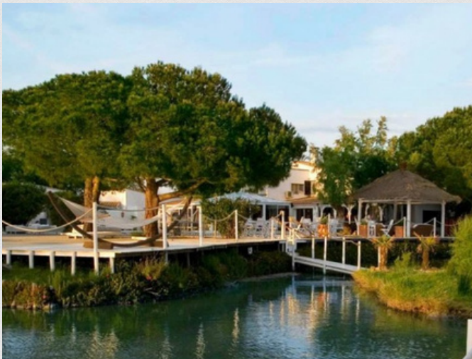
MAS DEL FOUQUE

IN THE EVENING WE'LL BE TREATED TO A THREE-COURSE GOURMET DINNER AT THE HOTEL'S FINE RESTAURANT.