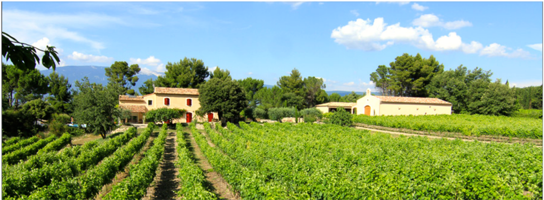
DOMAINE DU TIX WINERY

IN THE MORNING WE WILL HAVE A POWERFUL GUIDED MEDITATION AND PREPARE TO WALK THE PATH TO NOTRE DAME DES ANGES, AN ANCIENT CHAPEL RENOWNED FOR HEALING. AFTER LUNCH IN THE COURTYARD WE WILL LEAVE FOR THE BOUTIQUE WINERY DOMAINE DU TIX. THERE WE WILL HIKE THE PATH UP THE HILL TO THE CHAPEL AND RING THE BELL, OUR FINAL CEREMONY AND THEN RETURN FOR A TOUR OF THE VINEYARD. AFTERWARD WE CAN ENJOY PLAYING PETANQUE, EXCELLENT WINES AND A BBQ DINNER AT OUR HOME, CELEBRATING THE BEAUTY AND MAGIC OF PROVENCE ON OUR LAST EVENING TOGETHER.