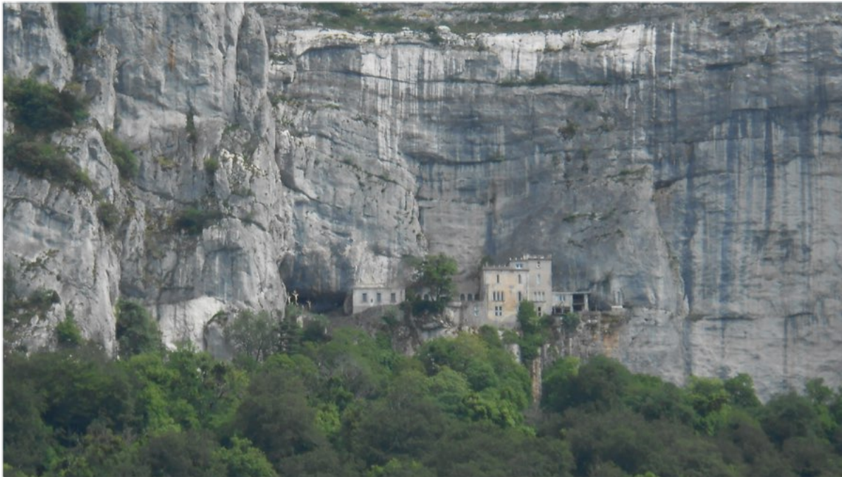
THE CAVE IN THE CLIFF

TODAY WE START EARLY AND DRIVE EAST TO THE VILLAGE OF ST. MAXIMIN TO VISIT THE BASILICA BUILT IN 1295 OVER THE CRYPT OF MARY MAGDALENE. WE WILL LEARN MORE DETAILS OF HER HISTORY AS WE WALK THROUGH THE BASILICA AND VISIT THE CRYPT UNDERGROUND. WE WILL HAVE A TASTY LUNCH IN THE CENTER OF THE VILLAGE AND DRIVE TO THE SAINT BAUME MOUNTAINS. HERE WE WILL TAKE THE PILGRIM'S PATH (A MODERATE 45 MINUTE HIKE) TO THE CAVERN WHERE MAGDALENE SPENT TIME IN MEDITATION AND REFUGE. THIS IS A POWERFUL SITE WITH A CRACKLING SPIRITUAL ENERGY VISITED FOR MILLENNIA BY ROYALTY AND COMMONERS ALIKE TO PAY HOMAGE TO THE WOMAN AND HER LEGACY. THAT NIGHT WE RETURN FOR A LATE DINNER AT THE INN.